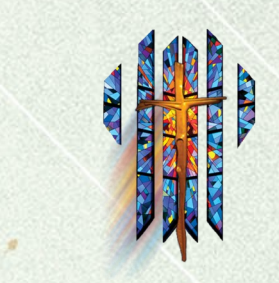
St. Philip Lutheran Church GATHER · SERVE · CELEBRATE

Throughout 2024, we have focused on relationships and being a community of faith. This coming year, in 2025, we will be focusing on being "Fulfilled Spiritually." We often focus on our mind and body, but don't talk much about our spirit or soul. The work of the church is spiritual work, and we are filled spiritually through the ministries of the church. Take a moment to look at the attached article that explains how the ministries of St. Philip fulfill us spiritually. The things that fill, satisfy or bring a person joy may be different for you than someone else, so I also invite you to reflect on what fills you. What are the things that fill your mind, body and spirit? How does St. Philip fill you or your family?